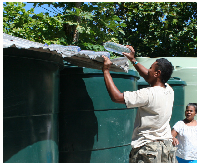
Solar water disinfection (SODIS) in Bairiki, Kiribati in 2014.