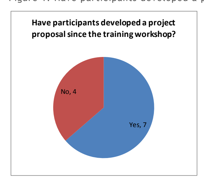
Figure 1. Have participants developed a project proposal?

All survey respondents indicated that the LFA steps would be useful (3 responses) or very useful (8 responses) in preparing any future project proposals. Seven survey respondents indicated they had completed or worked on a funding proposal since the training workshop was held (Figure 1).