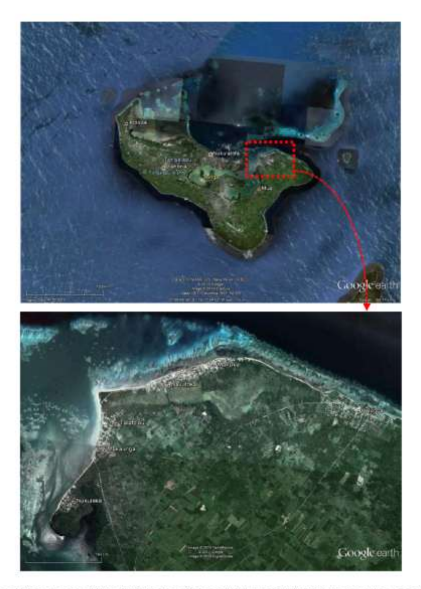
Figure 1.1. Location map of the 5 villages in eastern Tongatapu where the coastal protection pilot studies are planned. The study site incorporates the villages of Nukuleka, Wakaunga/Talafo'ou, Navutoka, Manuka and Kolonga